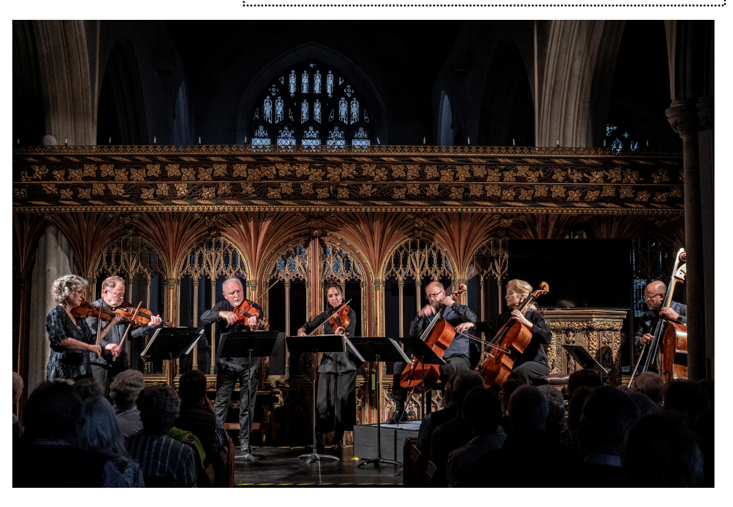
The Brodsky Quartet and friends