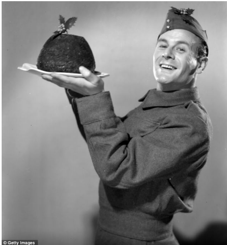
Christmas Spirit - 1939!