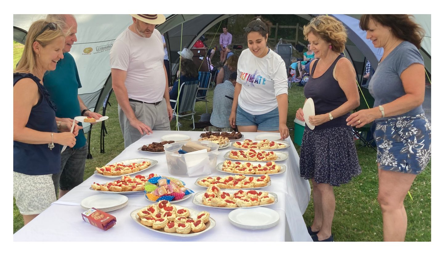
Proper Job! - cream teas at Heatree Activity Centre